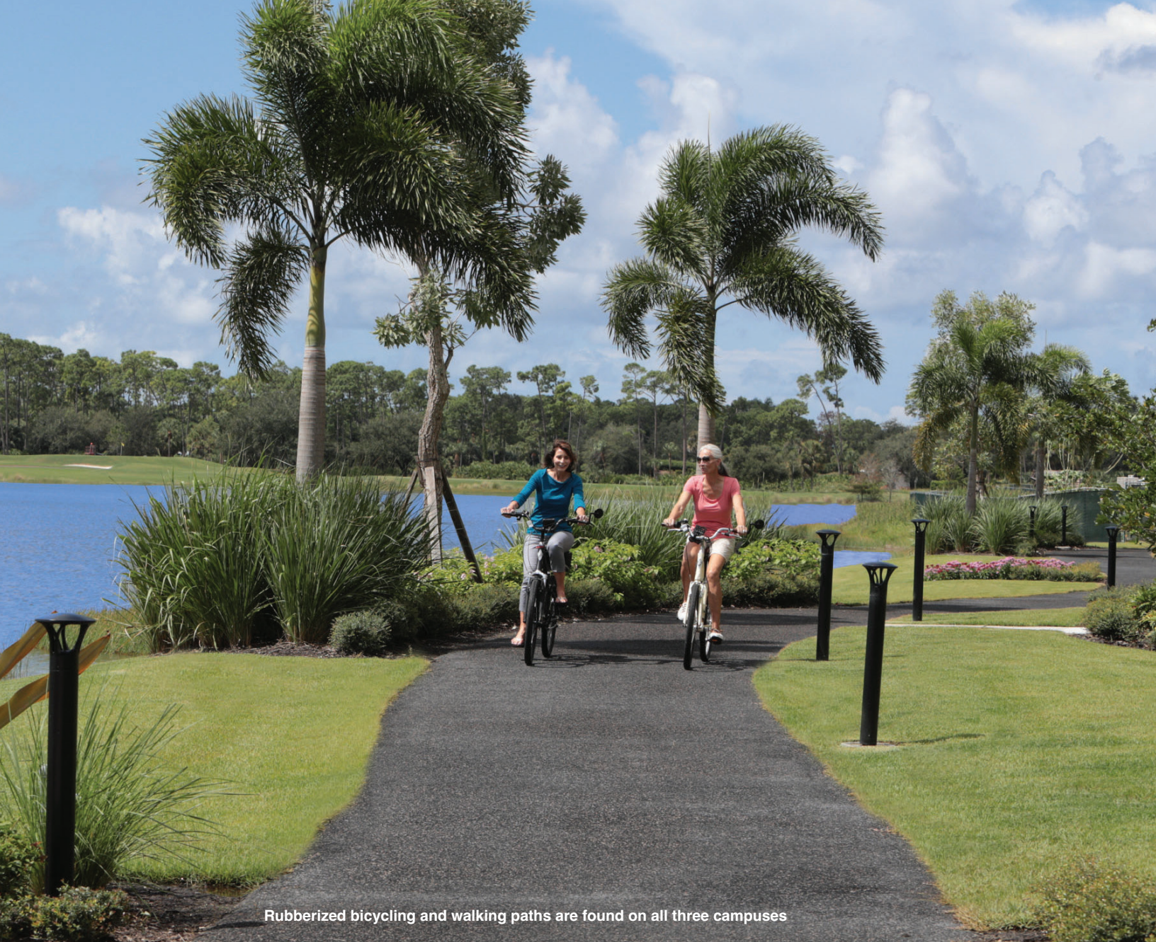
Rubberized bicycling and walking paths are found on all three campuses